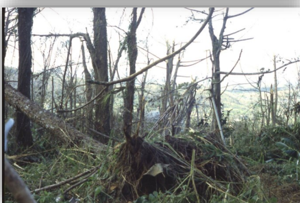
The photos above were photos taken before, during and after Hurricane George in 1998.