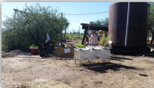
NRCS makes a presentation on soil.

Soil and vegetation. In this exhibit, students could see for themselves how water flowing over vegetated soil comes out cleaner than water draining from bare soil. The exhibit by the U.S. Department of Agriculture and Natural Resource Conservation Service also compared how much water drained through the soil rather than running off the soil, showing that once again soil covered with plants fared better.